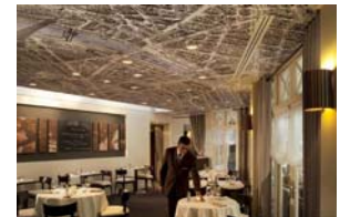
Le Relais du Parc Restaurant